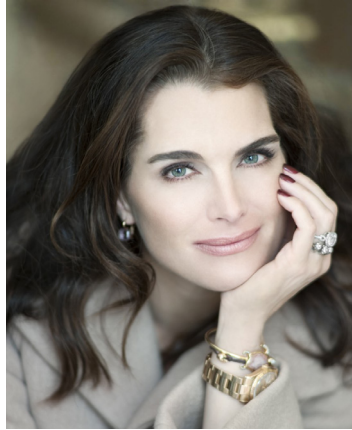
September 12, 2022 Brooke Shields

Brooke Shields is one of the most recognizable faces in the world. She began her modeling career at 11 months old and was the youngest fashion model ever to appear on the cover of Vogue magazine.